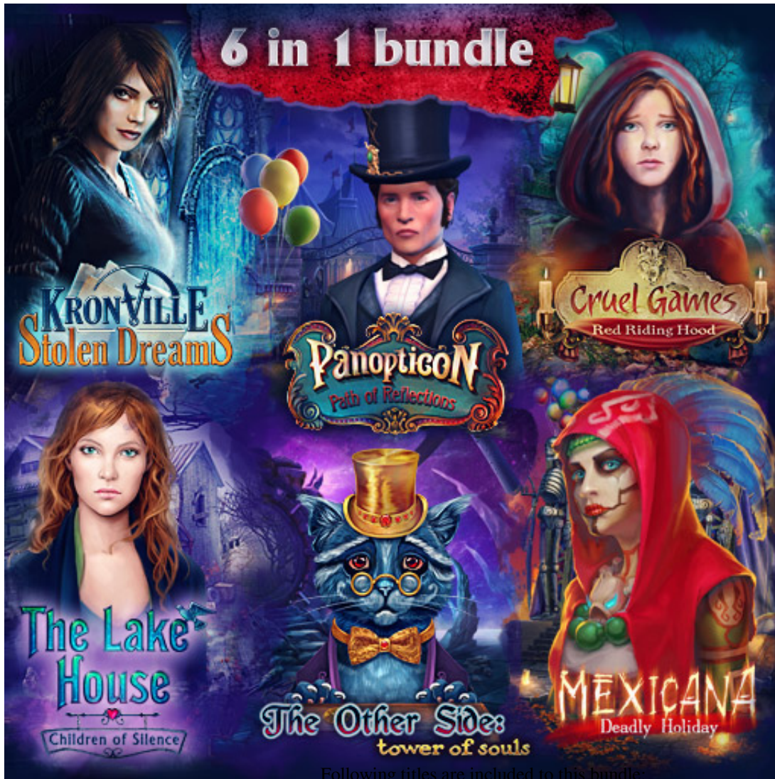
Following titles are included in this bundle: