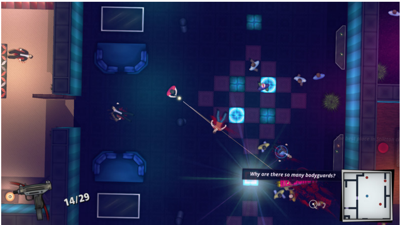
Foto Flash 2 Best Crack